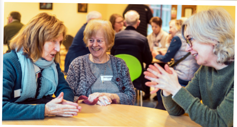
Parish partnerships across the Archdiocese are holding their own meetings, such as this one for the Ringsend, Sandymount and Haddington Road Partnership at the Avila Retreat Centre in March

YOUR WEEKLY SUPPORT FOR SHARE HELPS TO SUSTAIN THE LIFE AND MISSION OF THE CHURCH HERE IN THE ARCHDIOCESE OF DUBLIN