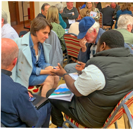
Discussions under way at a recent Building Hope workshop at St Mochta's Parish Pastoral Centre, Porterstown