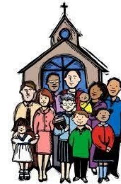
Our Church Family